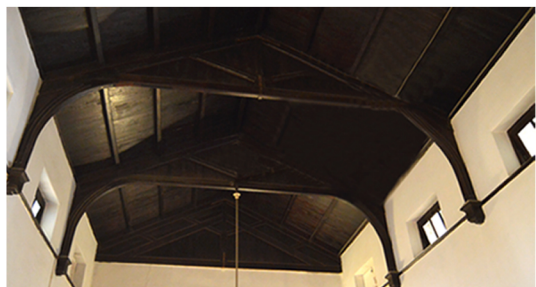
Variawala Villa Roof