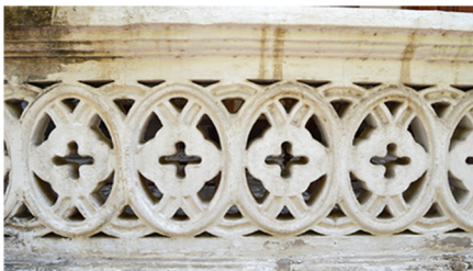
Cowasjee Residence Screen