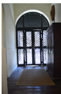
Habib Fida Ali Residence