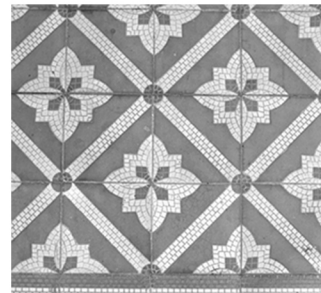
Variawala Villa Tile