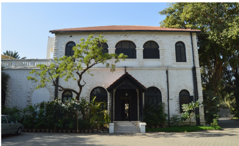
Habib Fida Ali Residence