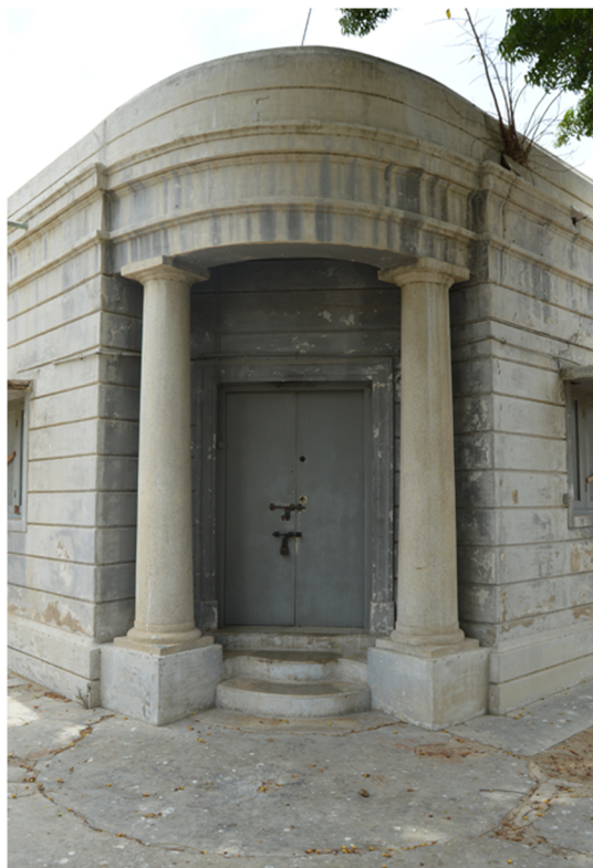
Tehna Villa Entrance