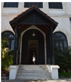
Habib Fida Ali Residence