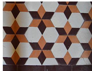
Variawala Villa Tile