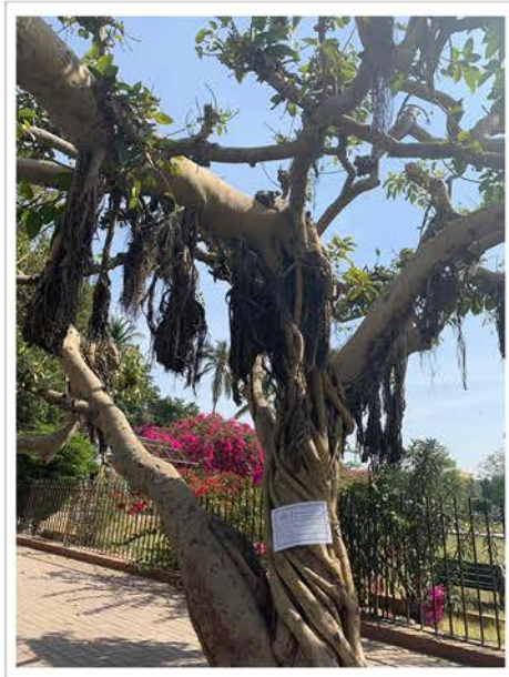
Fig. 7.0 - One of the 12 Trees shortlisted in Phase 01 assigned with its Digital Number Plate.

Title: Field Work - Placement of the Digital Numbering System on the Banyan Trees (Phase 03)