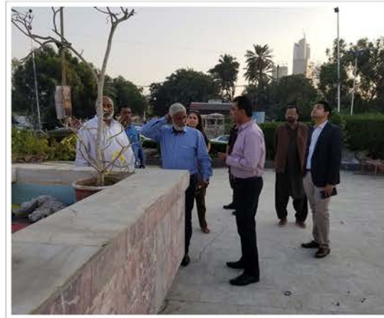
Fig. 5.1 - Team NHAK examines the site of Do Talwar regarding its Restoration and Development.