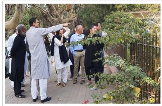
Fig. 6.1 - Senator Murtaza Wahab takes a look at the neglected Old Clifton Park on Shakra-e-Iran.