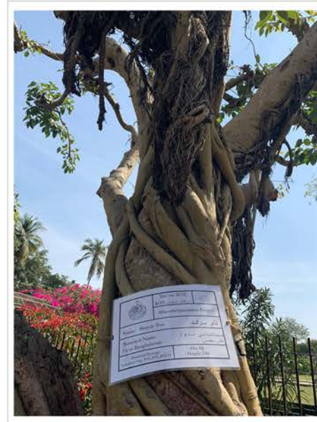
Fig. 7.1 - Tree No. B (32)