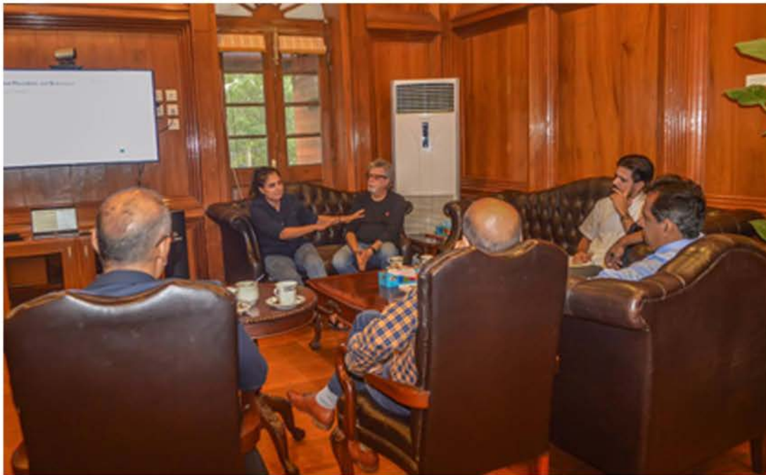
Fig. 2.0 NHAK Core Committee meeting with the government officials at the Commissioner house.

Title: Vision Presentation for Conserving Old Banyan Trees by Team NHAK.