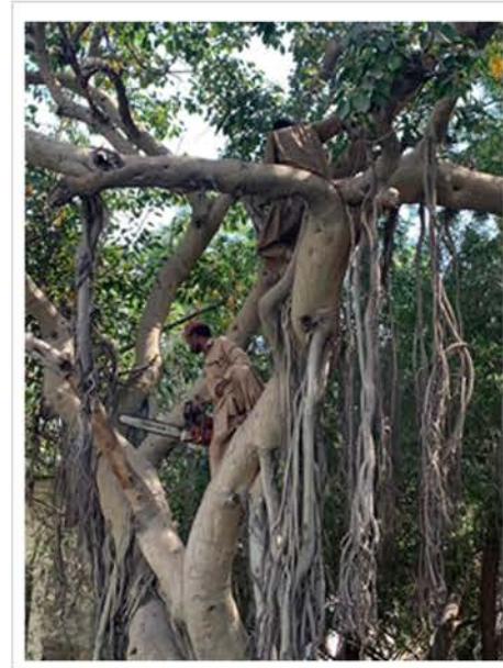
Fig. 8.1 - Field Work - Phase 04 in process.