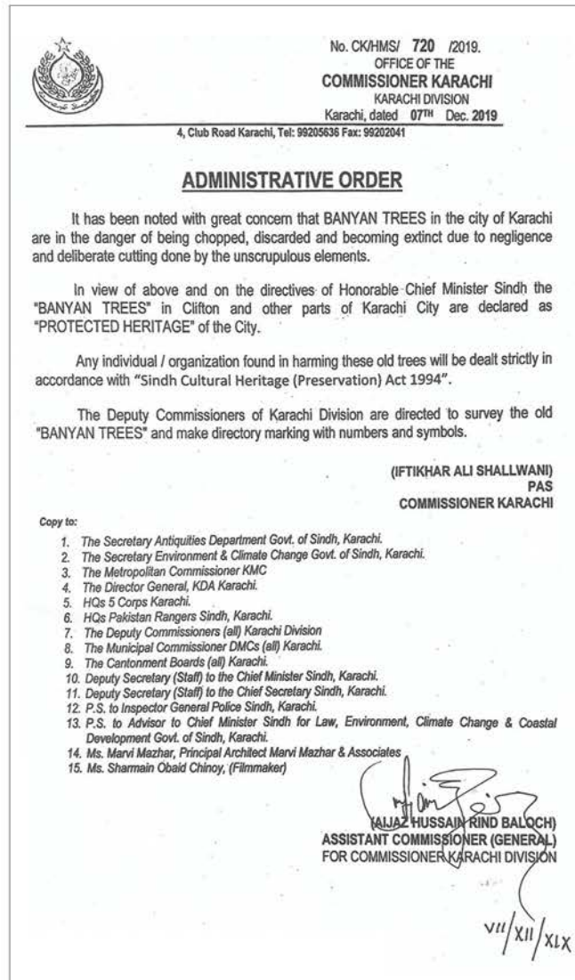
Fig. 4.0 A copy of the Administrative Order regarding the Declaration of The Banyan Trees as City's Protected Heritage.

Title: Official Declaration of Banyan Trees as a 'Protected Heritage' by the Sindh Government.