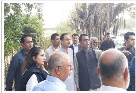
Fig. 6.0 - Members of the meetup brief Senator Murtaza Wahab and DC Irshad Ali Sodhar on site.

Title: Site Visit by Team NHAK and Senator Mr. Murtaza Wahab. (Phase 02)