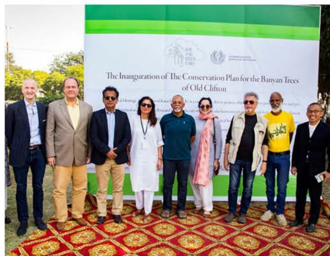
Fig. 3.2 NIIAK Team along with the foreign delegation at the event